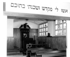
Synagogue of the União at the new home at Santa Alexandria Street, Rio de Janeiro