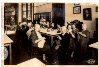
Sisterhood ladies at the elderly home of the União, still at 92 Alice Street, knitting for the needy in Germany during the II World War, prob. 1942